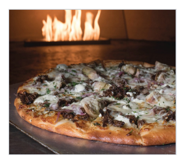
PIZZA BOX $25 /guest++ Wings ** Please select one flavor WET: buffalo | bbq | garlic parmesan

DRY: old bay | lemon pepper Served with bleu cheese or buttermilk ranch