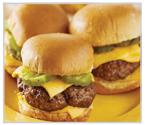
CUSTOM SLIDER BAR $26/guest++

Classic Cheese mozzarella, provolone, parmesan Pepperoni tomato sauce, mozzarella, cup and char pepperoni Margherita marinara, fresh mozzarella, tomatoes, fresh basil 3 Little Pigs sausage, pepperoni, bacon, mozzarella Veggie mozzarella, banana peppers, onions, tomatoes, basil