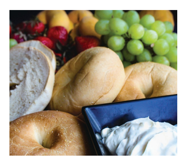
CONTINENTAL BREAKFAST $13/guest++

Assorted Muffins Assorted Bagels with cream cheese and assorted jams Assorted Yogurts and Granola Seasonal Fresh Fruit Platter Regular and Decaffeinated Coffee with cream and sugar Hot and Iced Tea