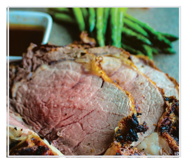
SIGNATURE FEAST $38/guest ++